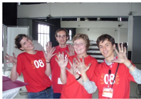
Organising a conference is a dirty job, but somebody has got to do it