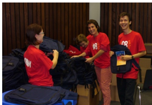
Registration team caught stealing chocolates from the conference bags.