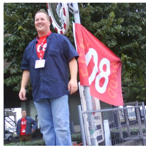
Our fearless leader and flag bearer acting as a shining beacon to the party people at the Stuurboord reception.